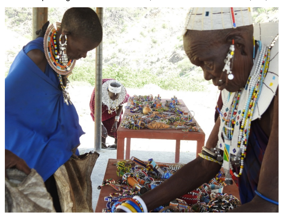
Figure 2: Maasai women display their beadwork at Ngare Sero booth

nine women secured five new markets<sup>6</sup> for their beadwork which will yield an increase in their monthly incomes. The end of project monitoring exercise demonstrated that after the exchange visit above, the women sold beadwork worth a total of Tshs. 10,000,000 (£3,430) between May 2019 and March 2020. Prior to expanding to these new markets, the women earned Tshs. 4,000,000 (£1,370) in a similar period.