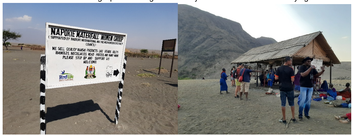
Figure 3: Signpost to the booth (L) and (R) tourists visiting at the Ngare Sero village booth near the waterfalls

During the reporting period, the project supported the design and installation of 6 signposts (Figure 3) that have been erected at strategic places along the roadways to direct tour vehicles carrying tourists.